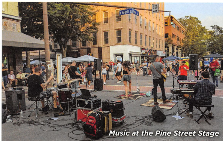
Music at the Pine Street Stage

Williamsport First Friday is a testament to the vibrant spirit of this beautiful city and its people, and without our downtown merchants staying open late, hosting artists, and helping make the evening special, this event would not be as successful as it is! So head downtown and enjoy over 80 local artisans and food trucks, local artists and bands from 5:00 p.m. to 9 p.m. There is free parking downtown after 3 p.m. For more information go to www.lycomingarts.org .