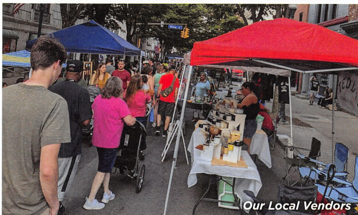
Our Local Vendors